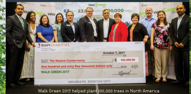
Walk Green 2017 helped plant 100,000 trees in North America

A contribution from your company or small business is an investment in your community, the environment, and the spirit of volunteerism.